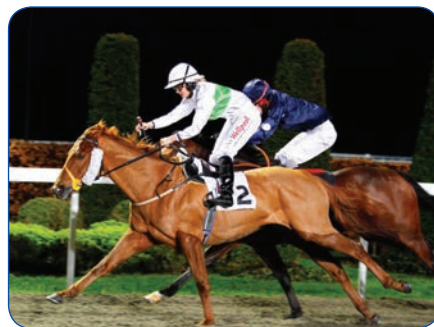
Nibani wins at Kempton in January.