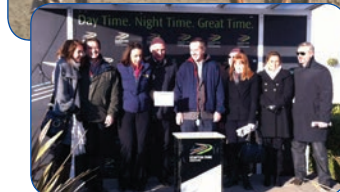
Majestic Zafeen wins by 3 1/2 lengths to the joy of connections celebrating on the podium at Kempton.